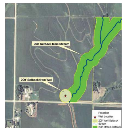
Example map showing separation distances

Separation distances are often defined by the buildings, areas or water sources they are intended to protect. Some separation distances apply only to liquid manure from confinement facilities and whether or not that manure has been injected or incorporated within 24 hours from the time of land application.