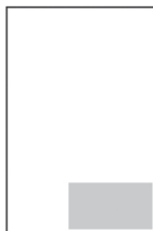
1/6 Page H 4-3/4" x 2-1/4"