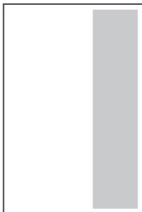
1/3 Page V 2-1/4" x 9-9/16"