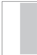
1/2 Page V 3-3/8" x 9-9/16"