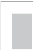
1/2 Page Island 4-1/2" x 7"