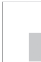
1/6 Page V 2-1/4" x 4-3/4"